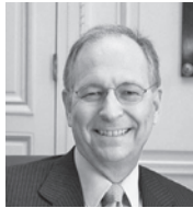
Ambassador Wolfgang Ischinger

Ambassador Ischinger is Chairman of the Munich Security Conference (MSC), and former Deputy Foreign Minister (State Secretary) of Germany, 1998 to 2001. From 2006 to 2008, he was the Federal Republic of Germany's Ambassador in London and from 2001 to 2006 in Washington, D.C. In 2007, he represented the EU in the Troika negotiations on the future of Kosovo. In 2014, he served as the Special Representative of the OSCE Chairman-In-Office promoting national dialogue in the Ukrainian crisis. He currently chairs the OSCE "Eminent Persons Panel on European Security" which is mandated to offer recommendations on how to build a more resilient architecture of European security.