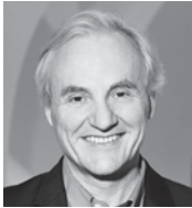
Prof. Ernst Fehr

Ernst Fehr is Professor of Microeconomics and Experimental Economics at the Department of Economics at the University of Zurich and Director of the UBS International Center of Economics in Society. He is also Vice Chairman of the Department of Economics and Global Distinguished Professor at New York University.